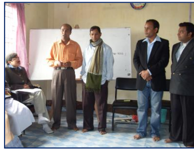
Picture 05: Participants are presenting their opinion in the training