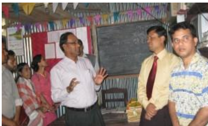
A moment of visiting an education centre of Munshiganj sadar by the honourable Project Director, PLCEHD-2, District Commissioner (DC), Munshiganj and Executive Director, EC Bangladesh