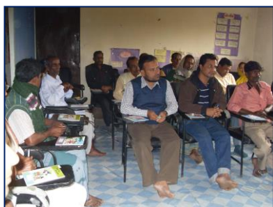
Picture 04: Training on fundamental human rights