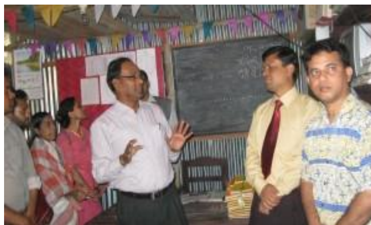
A moment of visiting an education centre of Munshiganj sadar by the honourable Project Director, PLCEHD-2, District Commissioner (DC), Munshiganj and Executive Director, EC Bangladesh