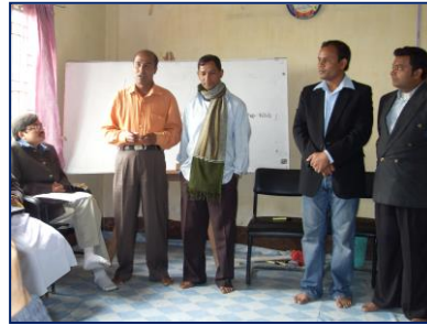
Picture 05: Participants are presenting their opinion in the training