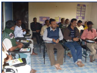
Picture 04: Training on fundamental human rights